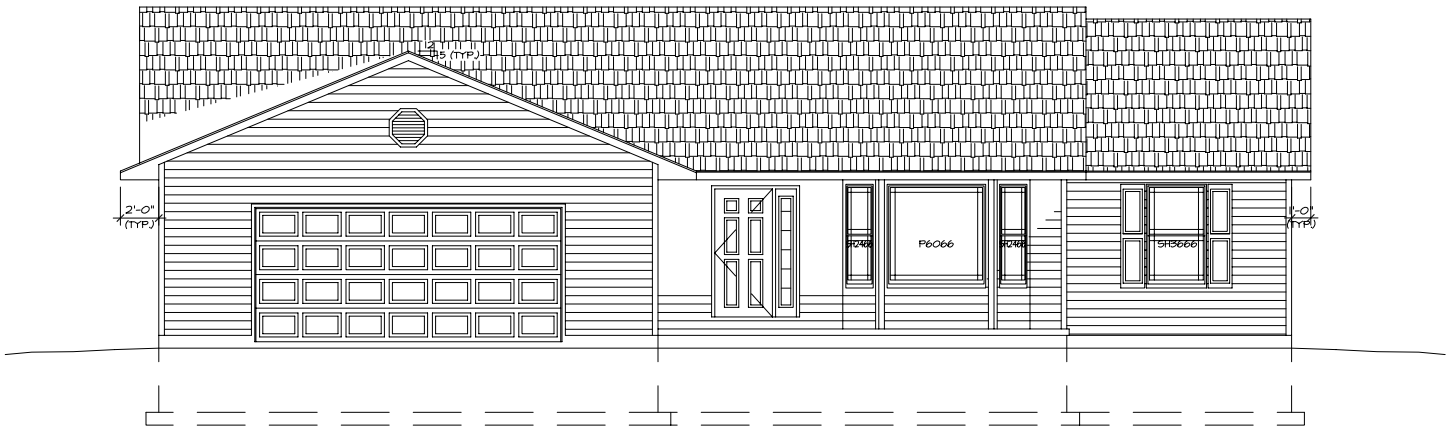
1 FRONT ELEVATION A-1 SCALE: 1/4"=1'-0"